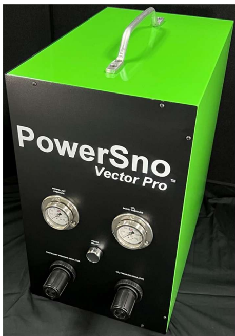
PowerSno™ Vector Pro USTS Universal CO 2 Spray Treatment System