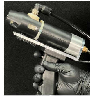
Micronizer™ Spray Applicators Shown Above: TRIAD